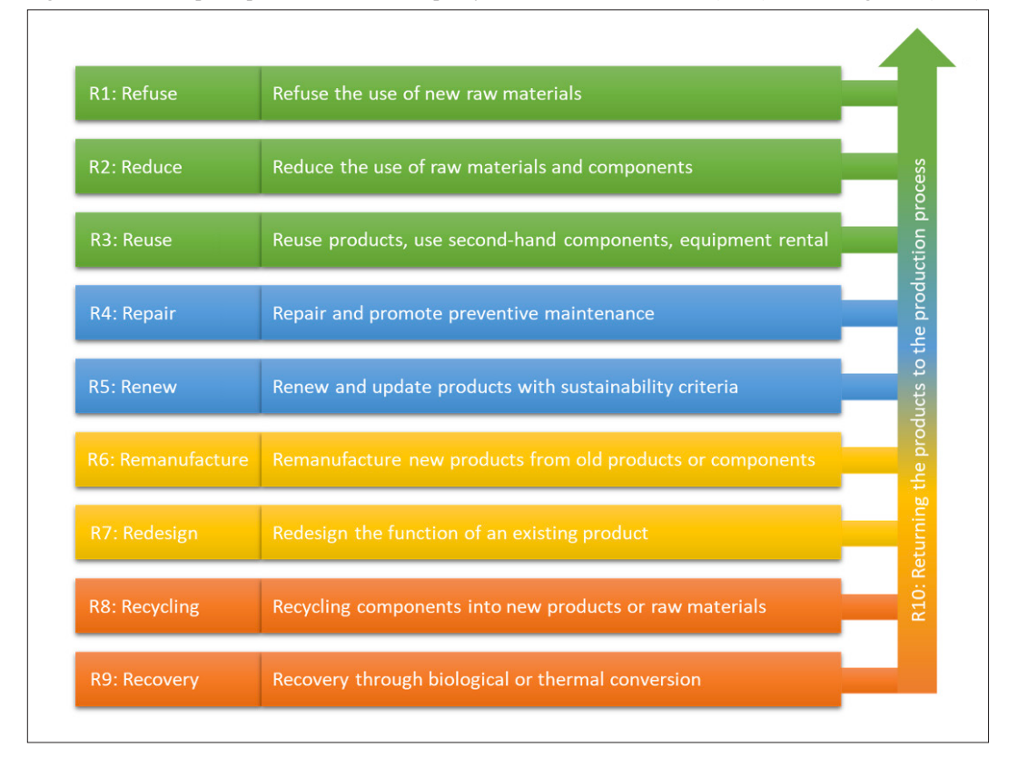
Figure 2 - The 10R principle. Own elaboration partly based on van Buren et al. (2016) and Potting et al. (2017).

omy is "one that is restorative and/or regenerative in intention and design" (Ellen MacArthur Foundation, 2013) and has as principles to eliminate waste and pollution, circulate products and materials (at their highest value), and regenerate nature (Ellen MacArthur Foundation, 2023).